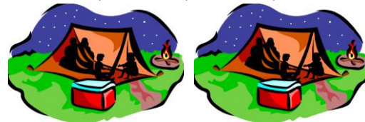
Summer Term 2 (after May half term)

A quick reminder that the Key Stage 2 Residential Information Meetings are this week. See our list of dates below for the date and times. We have scheduled these on the same date for parents/carers who have children attending both camps. We hope to see you there.